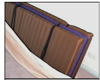
The Thermarest mattresses half out of the envelope that I had made. The elastic straps make for easier folding, and if you slip between the cracks in the night, the elastic gently pulls them together again.

Mattress. Therma-Rest luxury series. Self inflating so you don't need compressors and things. Dear as poison, but the best and worth it for a good night's sleep. I bought three and linked them with wide elastic (see photo). They came out of their envelope, complete with King size fitted sheet, every night and fitted just nicely into the floor of the Oztent.